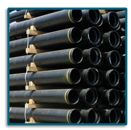
Valley Watermain Replacement

approximately 5,000 linear feet of AC Watermain with 12" Ductile Iron Watermain. This project will greatly improve system reliability as we have experienced multiple leaks over the last 4 years. Unfortunately, due to supply issues this project has been delayed and will not be started until April or May of 2023.