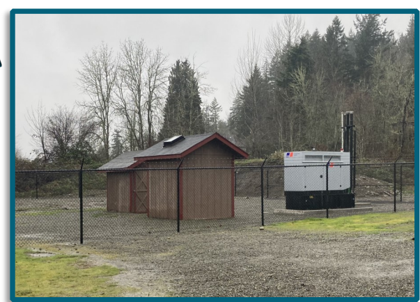
New generator for Sierra 2022

The improvements that were started in 2021 to add telemetry and install a new generator were completed in early 2022. These upgrades have significantly improved system reliability during power outages and will help improve response time and monitoring capability for staff.